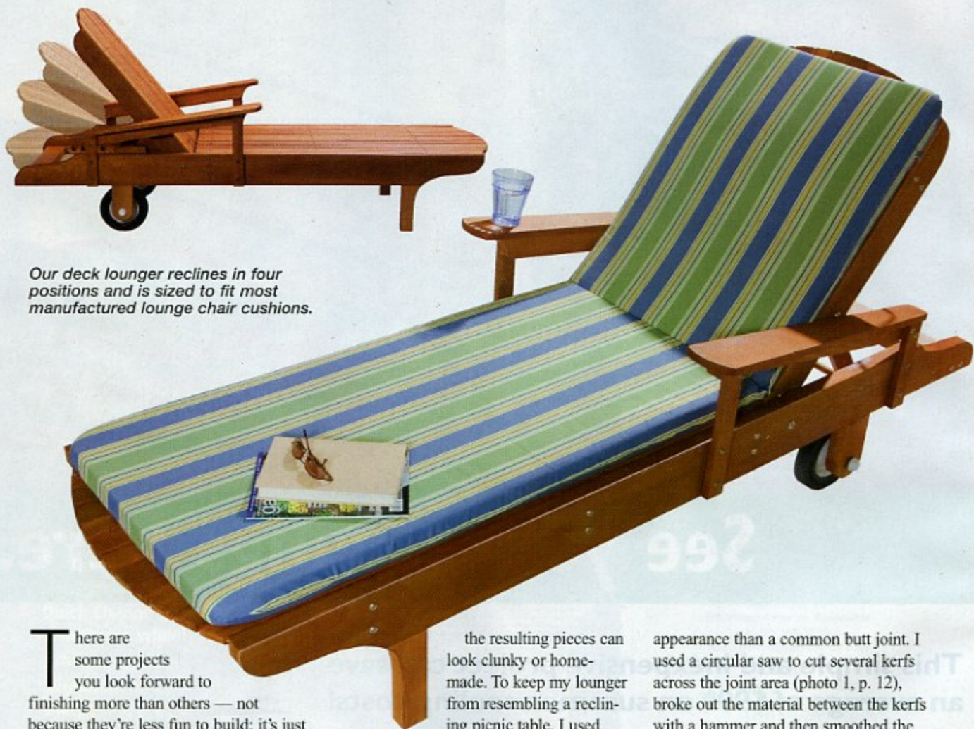
Our deck lounger reclines in four positions and is sized to fit most manufactured lounge chair cushions.

There are some projects you look forward to finishing more than others — not because they're less fun to build; it's just that you can't wait to put them to use. This reclining deck lounger is a perfect example. Unlike building a wheelbarrow or workbench, a project that ultimately just enables you to do more work, once you complete a deck lounger you get to relax (and even put your feet up).